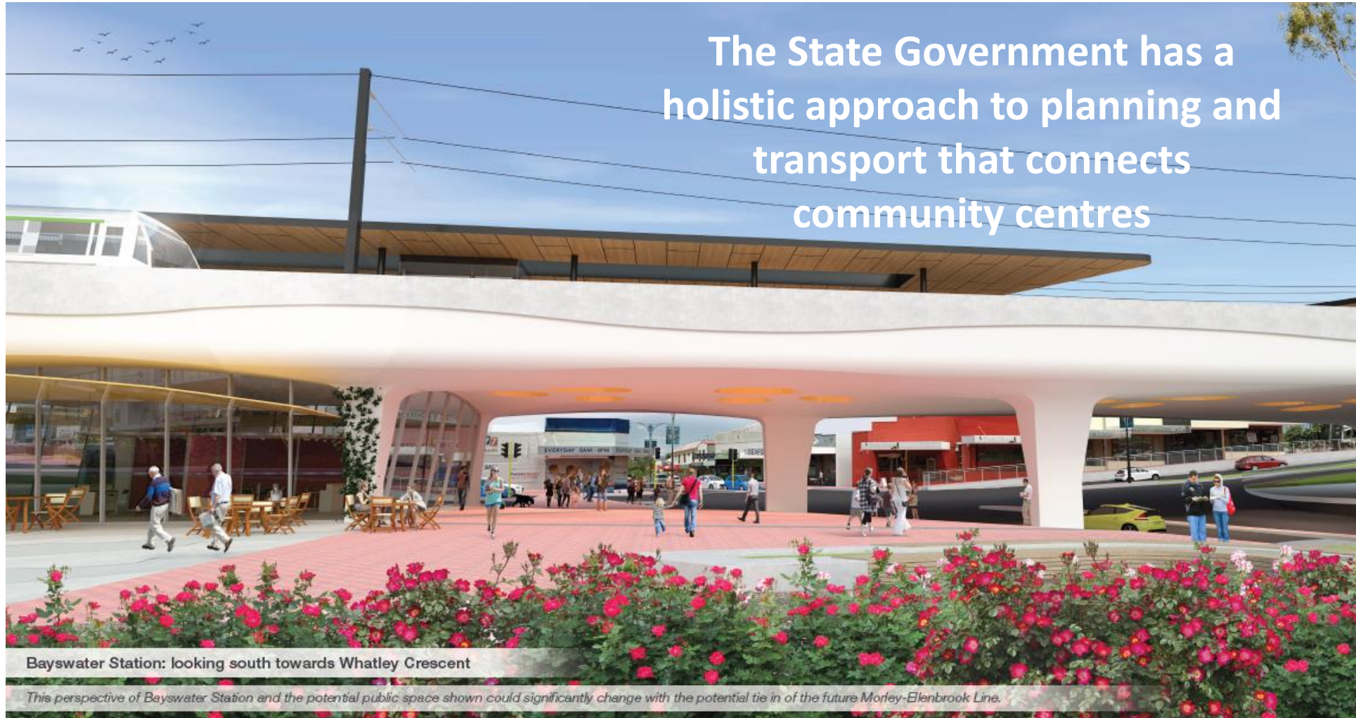
Bayswater Station: looking south towards Whatley Crescent

The State Government has a holistic approach to planning and transport that connects community centres