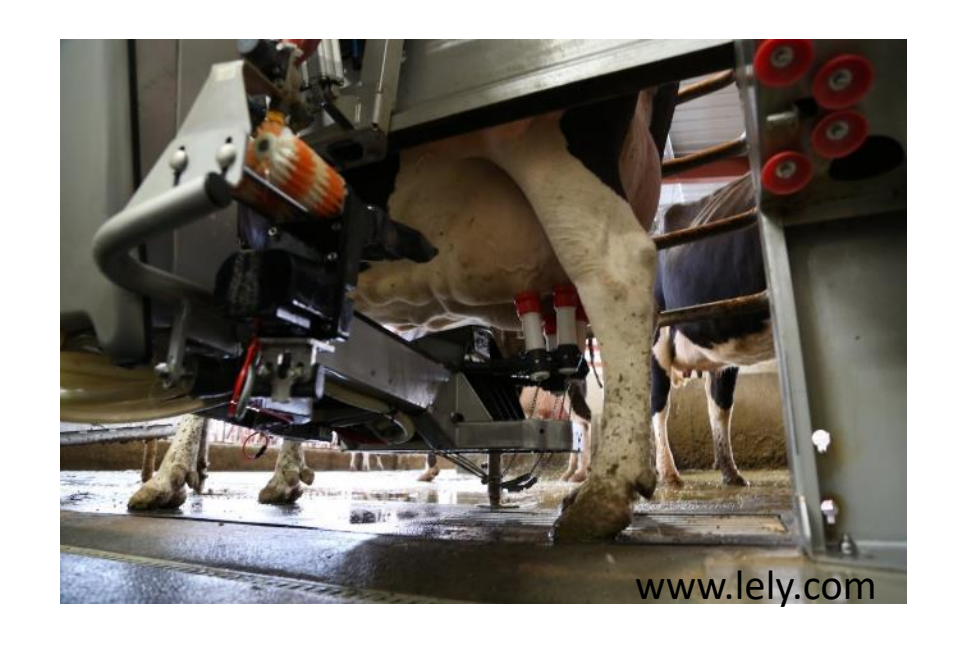
As costs come down, implementation will increase quickly