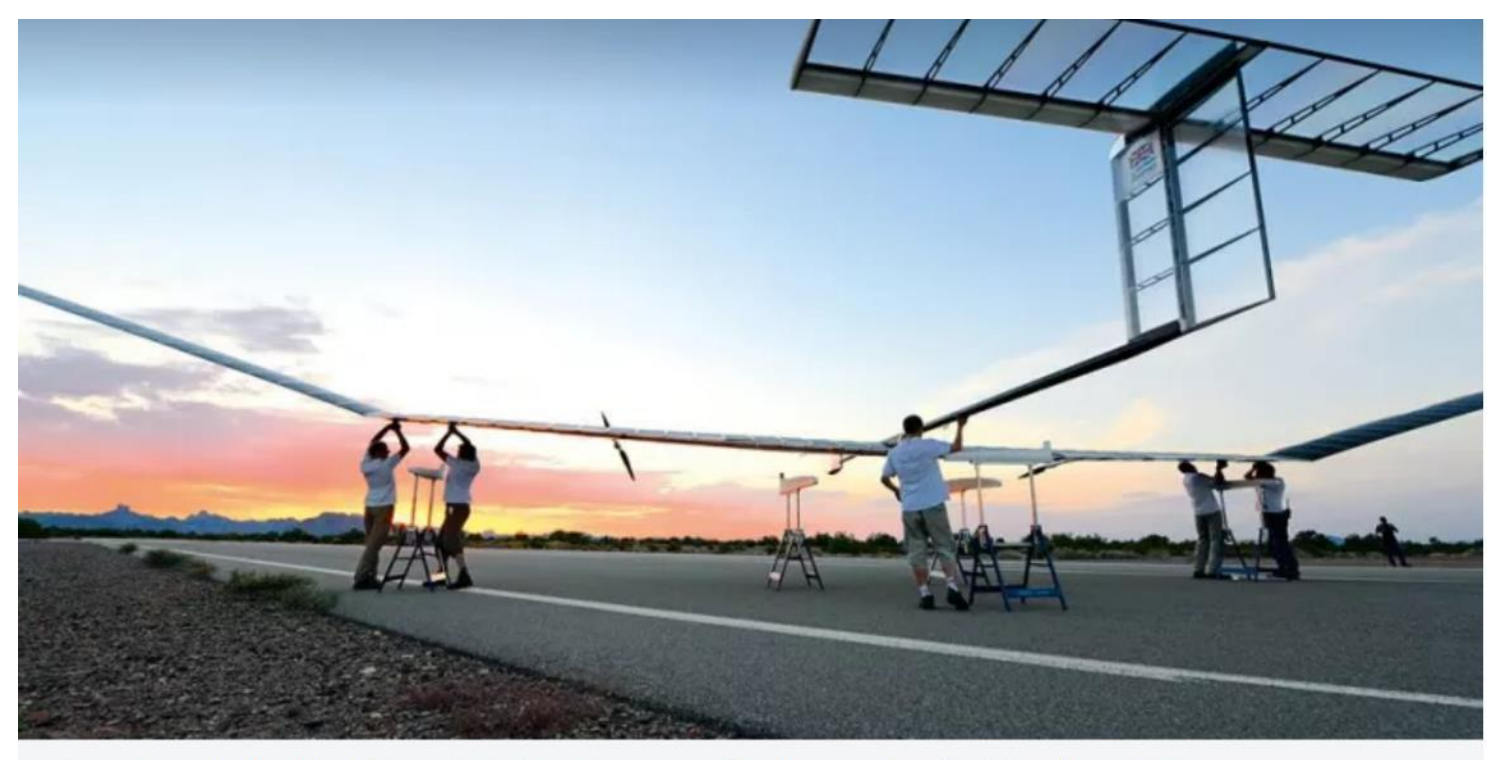
Airbus has announced it will base its Zephyr solar-powered unmanned aircraft at Wyndham airfield.